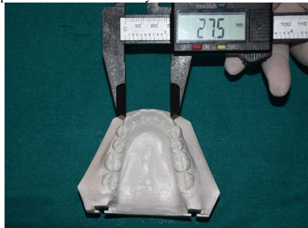
Figure 4. Measurement of inter canine distance in Mandible

Mesiodistal width measurement: The subjects were seated on a dental chair and impressions were taken with Alginate impression material and study models were fabricated.