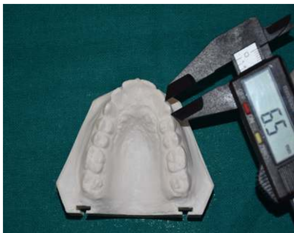
Figure 1. Measurement of mesio distal width of canine in Maxilla

spacing, periodontally healthy teeth, noncarious and nonattrited teeth, diastema or crowding and subjects with no clinical evidence of any restoration, orthodontic treatment, and trauma. The significant exclusion criteria for selection of the study sample were the presence of partially erupted/ectopically erupted teeth, patients with dental/occlusal abnormalities, teeth showing physiologic or pathologic wear and tear and patients with deleterious oral habits (like bruxism).