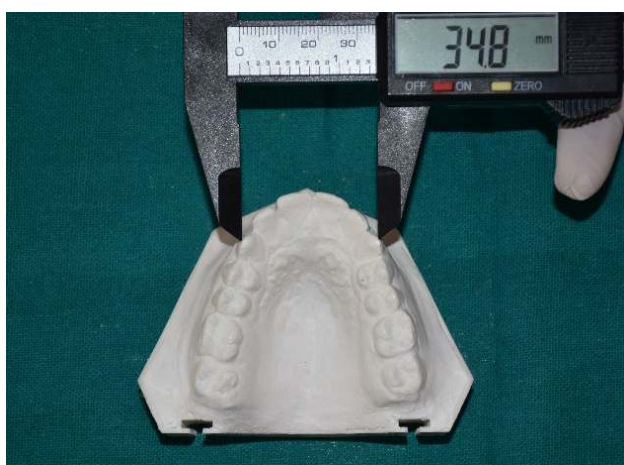
Figure 3. Measurement of inter canine distance in Maxilla

Mesiodistal width measurement: The subjects were seated on a dental chair and impressions were taken with Alginate impression material and study models were fabricated.