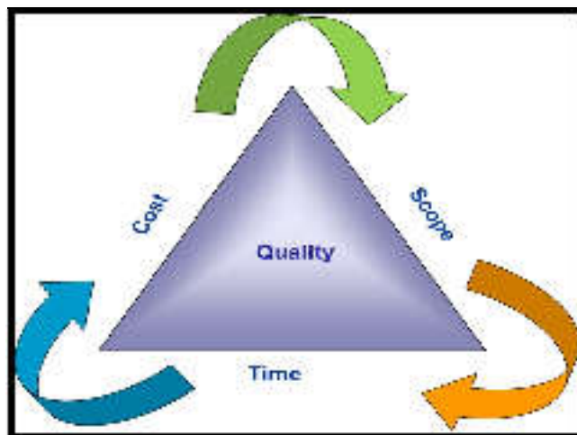
Figure 3. A schematic of the triple constraint triangle

manager have to balance the needs of the constraints against the needs of the stakeholders according to this triangle figure (3) (Watts, 2014).