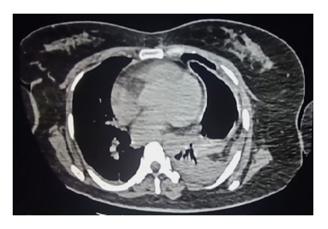
Figure 2. Oral contrast CT scan showing herniation with stomach as content