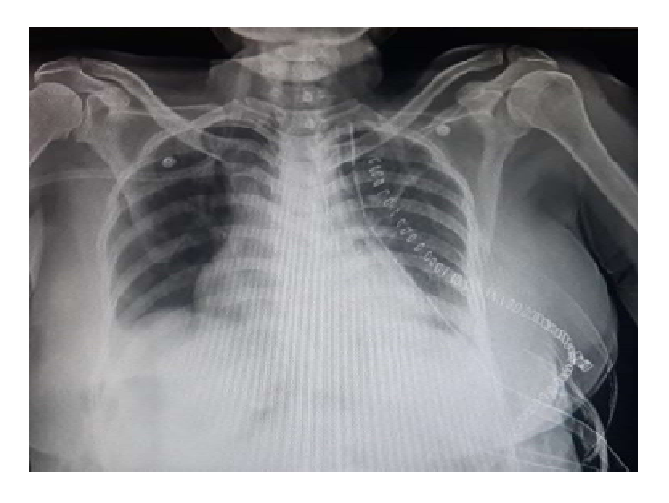
Figure 3. Post-operative x-ray with left dome of diaphragm in normal position, no abdominal contents in the chest

All the adhesions were released and all the abdominal contents like stomach with Ryle's tube insitu were pushed back into abdomen. Now the margins of Morgagni's defect visualised except retrosternal and retrochondral area which was deficient. Defect was closed with Trulene polypropylene mesh with using twenty-four size 2-0 pledgettedTrulene polypropylene sutures circumferentially. Anterior margin of Morgagni's defect was deficient and was created by going through Trulene polypropylene sutures thorough periosteum of chondrum and sternum. No residual defect was left. Hemostasis was achieved using Trutie ligating clips. Thoracotomy was closed with size 2-0 Trusynth polyglactin-910 suture in layers. Skin closure was done with size 3-0 Monoglyde poliglecaprone-25 sutures and 2 intercostal drainage tubes (ICD) were inserted.