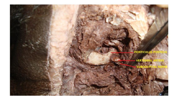
Figure 1. Showing Right sided Atlas with Ponticulus Posticus