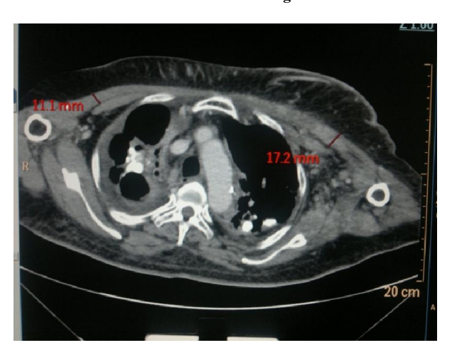
Figure 4. CT chest showing thickened Pectoralis major and minor on the left side with loss of contour