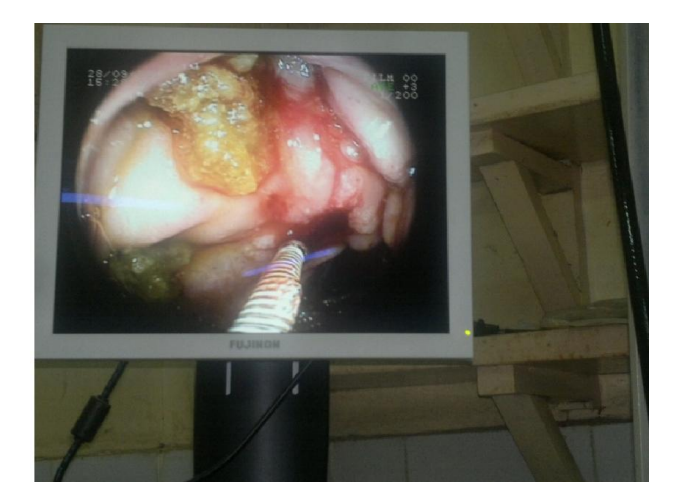
Figure 6.OGD showing multiple sessile polyps in 2<sup>nd</sup> part of duodenum with post-biopsy bleeding

for oral chemotherapy. Capecitabine 1000mg twice daily in 6 cycles, each of 21 days with 7 days interval was advised. The patient had marked reduction in breast size and size of supraclavicular and axillary lymph nodes on the left at 2 months follow-up (Fig 7).