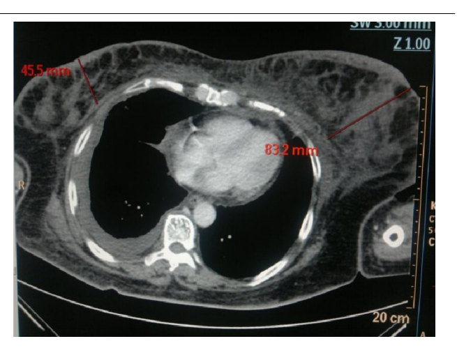
Figure 3. CT chest showing thickened left breast measuring 83.2mm v/s 45.5mm on right side

FNAC of retro-areolar lesion in left breast revealed anucleated squames. Punch biopsy from peri-areolar skin didn't reveal evidence of lymphatic invasion. Computerized Tomography (CT) of thorax revealed 2 times thickness of the left breast compared to the right with loss of contour of pectoral muscles on the left and left axillary lymph node measuring 29x17mm² (Fig 3-5). Oesophago-gastro-duodenoscopy (OGD) revealed multiple friable sessile polyps in the 2nd part of duodenum (Fig 6), which on histo-pathological examination showed features of adenocarcinoma.