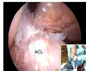
Knee arthroscopic view

AAW- Anterior Abdominal Wall, FL-Falciform ligament, AC-Acetabular cavity, SP-Spine, ACL-Anterior Cruciate ligament