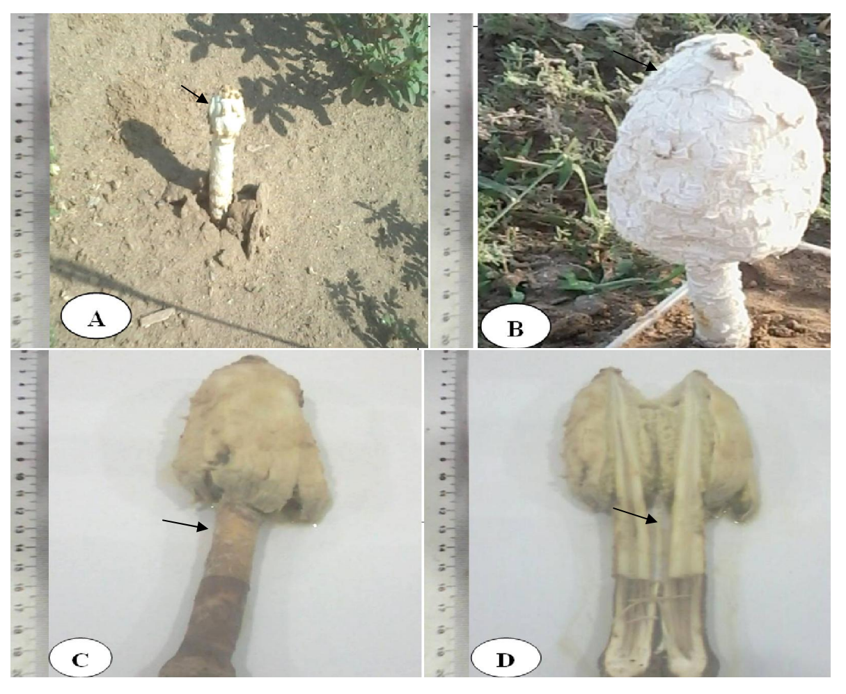
Fig.1. Showing a field habitat of the fruiting body of Podaxis pistillaris at different stages of development (A &B), Earlier stage (A), Mature stage(B) body submitted to examination in lab (C). Longitudinal section for the fruiting body (D)

Earlier investigators reported the presence of Podaxis pistillaris during rainy seasons, they noticed that the fruiting bodies are varied in shapes, color, size which may be due to the variation of fruiting bodies, species and growing stage (Hashem and Al-Rahmah, 1933 and Gardiner et al., 2005). Our study showed that the examined specimens were similar to the species of the collected Podaxis pistillaris samples (Panwar and Purohit, 2002). The specimens of Podaxis pistillaris were kept in the herbarium of Biology Department, College of Science, Jazan University. The morphological characters was recorded earlier in Al- Mekwah city, Albaha, Saudi Arabia by (Yehia and Al-Ghamdi, 2014). The obtained data are agreed with those mentioned by other investigators (Khatri et al., 2009). It is used in herbal remedies in the traditional folk medicine. It can be considered as a potential source for the creation of a new products and drugs (Lindequist and Niedermeyer, 2005). The present study showed the importance and morphological features of Podaxis pistillaris in medical industry as mentioned before (Al-Fatimi, 2001 and Kreisel and Al-Fatimi, 2004).