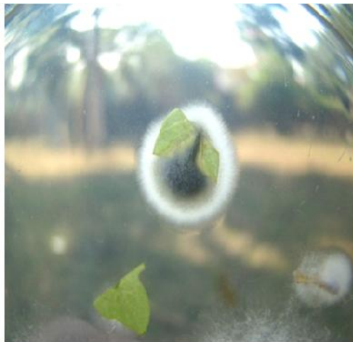
a. Recovery of M. anisopliae from leaf