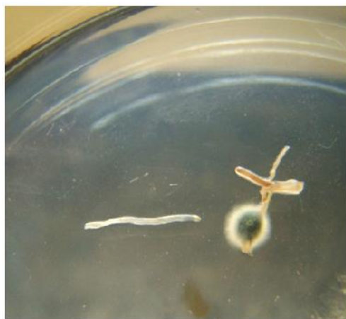
c. Recovery of M. anisopliae from root