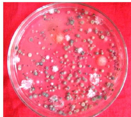
d. Recovery of M. anisopliae from soil

This was followed by combination of seed and substrate treatment with M. anisopliae where recovery of 44.44%, 55.55%, 22.22% and 98.33 cfu/g of soil was recovered from leaves, shoots, roots and rhizosphere respectively. When substrate was treated alone recovery of M. anisopliae was recorded as 33.33%, 33.33%, 22.22% and 90.33 cfu/g of soil for leaves, shoots, roots and rhizosphere respectively (Table 2.). Lowest recovery of M. anisopliae with 11.11% and 60.33 cfu/g of soil was recovered from all the plant parts and rhizosphere respectively.