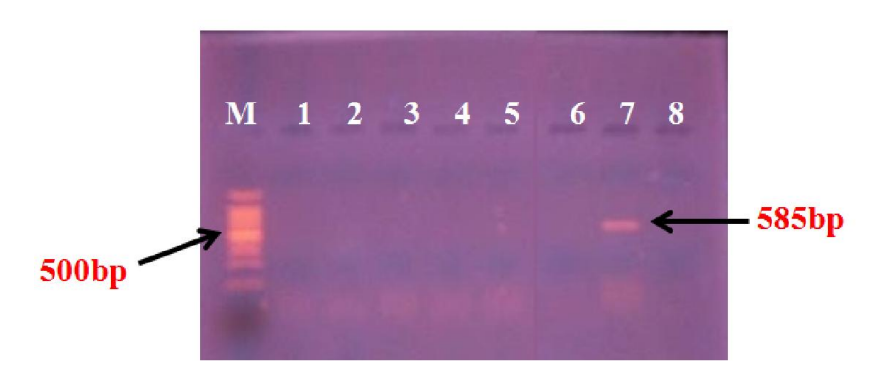
Figure 3. Gel Electrophoresis of pro gene (585bp), using 100bp DNA ladder. (M=DNA ladder; Lane (7)=positive pro. F. proliferatum; Lanes (1-6 and 8) =negative)