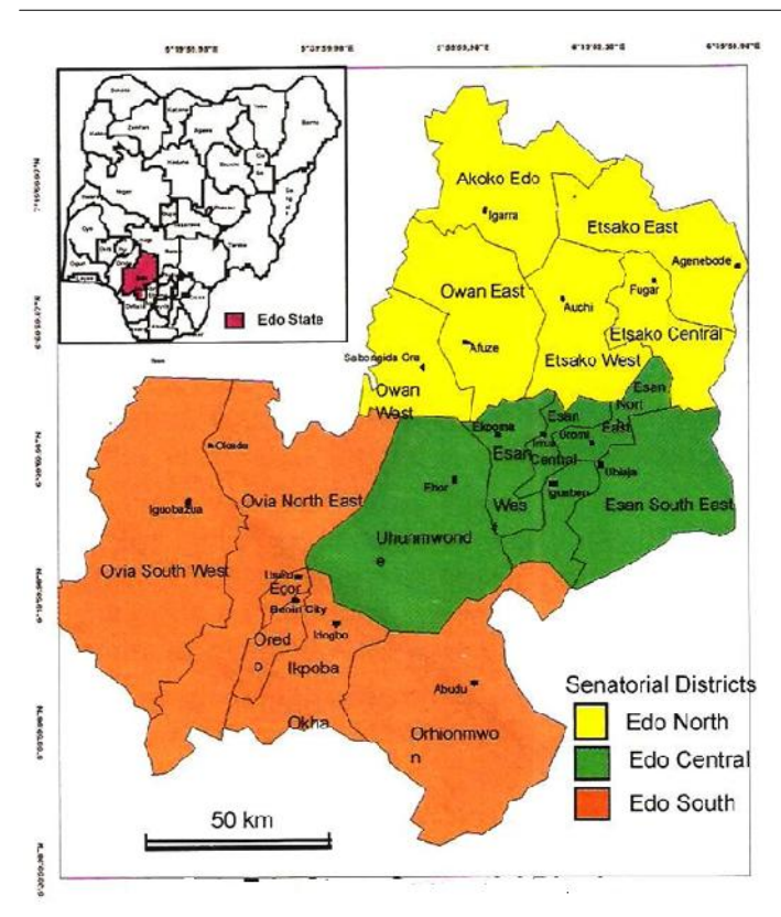
Fig. 1. Edo State Senatorial Zones