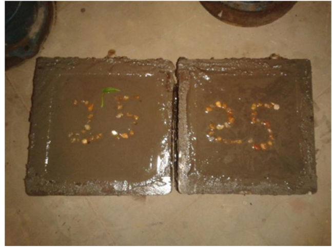
Testing of samples