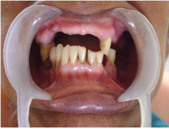
Fig. 1. Pre Operative intra oral view