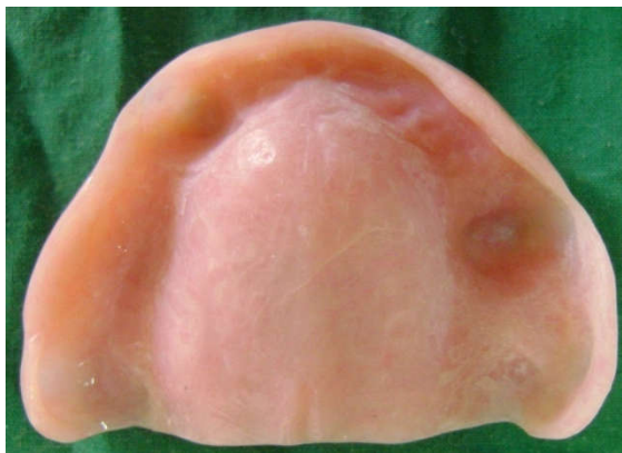
Fig. 7a. Finished maxillary denture intaglio surface