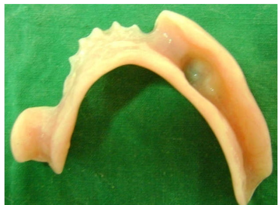
Fig. 7b. Finished mandibular denture intaglio surface