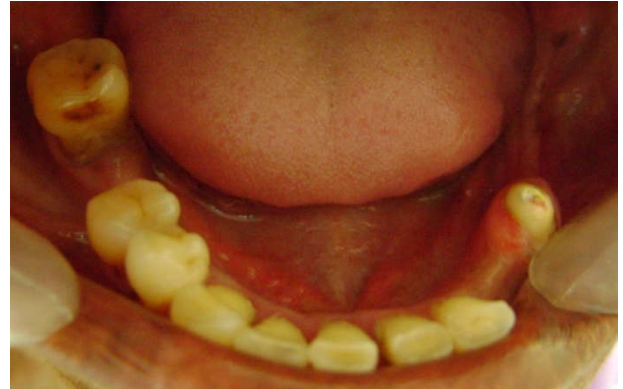
Fig. 3b. Mandibular tooth preparation for short coping

Cast metal short copings in 16, 23, and 35 with a dome shaped surface were cemented using type I GIC luting cement. (Fig.4) Conventional denture fabrication technique was used to construct the over denture. Primary impression was made, special tray fabrication, final impression with elastomeric material, (Fig.5) jaw relation record, wax try-in procedure (Fig.6) should be carried out. Denture was fabricated using conventional method and insertion done. Care should be taken on the tissue surface of the fabricated denture, the areas near the gingival margins to be trimmed in order to avoid tissue impingement. (Fig.7) Post insertion instructions given to patient, in future tissue surface of the denture lined with soft resilient liner for better adaptation. (Fig.8, 9)