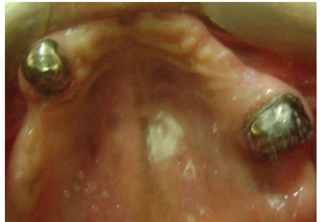
Fig. 4a. Cementation of metal coping in maxillary arch