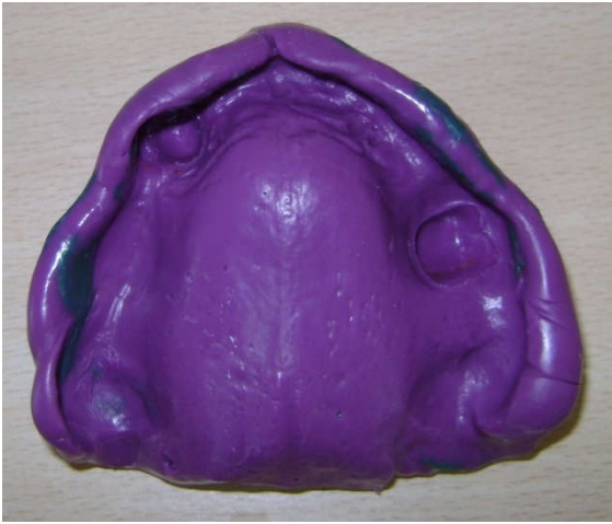
Fig. 5. Elastomeric final impression