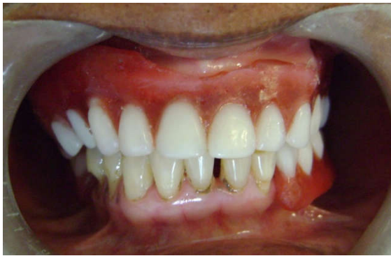
Fig. 6. Wax denture try-in