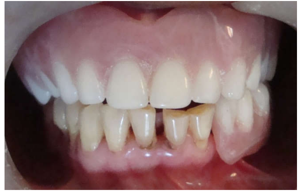
Fig. 8. Overlay final denture in situ