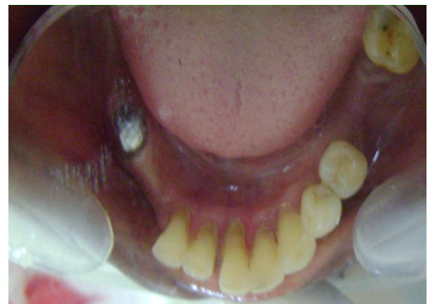
Fig. 4b. Cementation of metal coping in mandibular arch