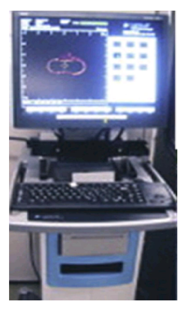
Fig. 1. Optical Coherence Tomography