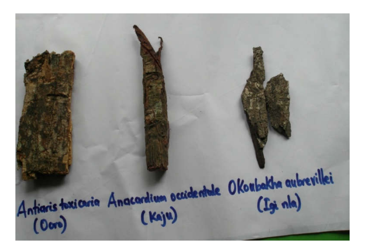
Fig. 3: Photograph showing some of the collected tree barks