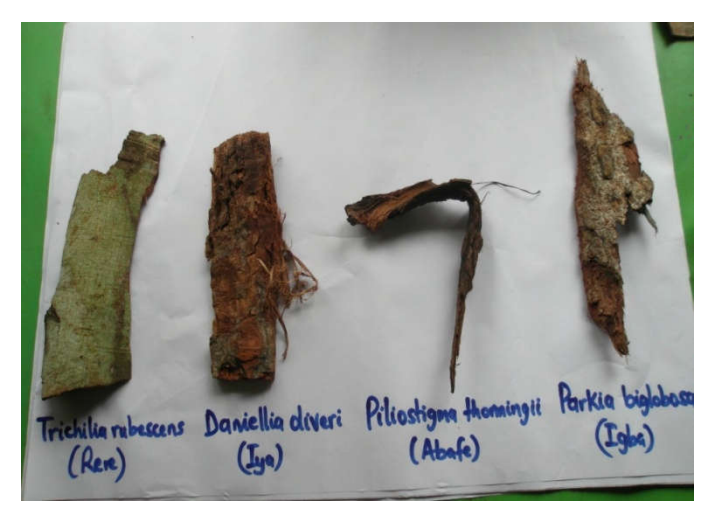
Fig 4: Photograph showing some of the collected tree barks