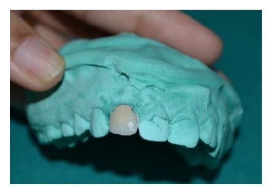
Fig. 9. Diagnostic cast with richmond crown

Diagnostic cast was made and RICHMOND CROWN was prepared. Fig.9