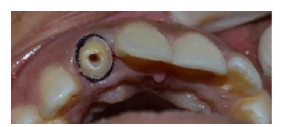
Fig. 7. Gingival retraction cord

Gingival retraction cord was placed below the finished margins of the tooth with the help of a cord packer. Fig.7