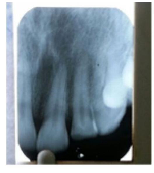
Fig. 1b. pre-operative radiograph

Root canal opening was done with a round and tapered bur, working length was determined at 19mm with the help of an