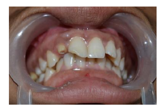
Fig. 3. Crown preparation