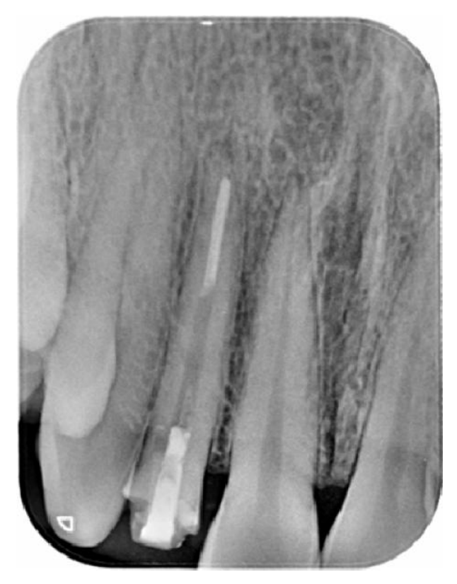
Fig. 2a. Root canal opening

Post space was prepared with Peeso reamer (size 3) to remove guttaperchaupto one-third off roots length (care was taken not to disturb apical seal) Fig.2(b). Undercut areas within the canal were blocked with glass ionomer cement and preparation was ended with the use of H-file (circumferentially) to smoothen the walls of the post space.