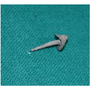
Fig. 5b. Casting