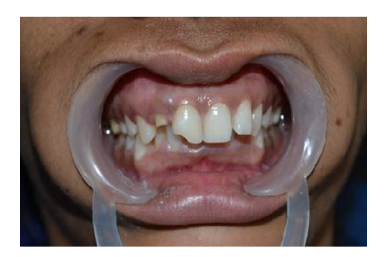
Fig. 1a. pre-operative image

18 year female patient reported to our department (conservative dentistry & endodontics pacific dental hospital, udaipur) with a complain of fractured upper front teeth and she desired to get it restored. She gave history of trauma 6 years back with the same tooth as she had fell down and broke her front two teeth. She gave no history of pain in any of her teeth. she gave no significant medical and family history .she was well built and coperative. Clinical examination revealed Ellis class 2 fracture with 11 and Ellis class 3 fracture with 12. Fig.1a. Dental caries in16,17,26,27,36,37. Radiographic examination revealed incisal radiolucency involving enamel and dentin with 11 and radiolucency involving enamel, dentin and pulp with 12. Fig.1b. Centric occlusion was found and patient had deep bite and less overjet. Pulp vitality test was performed and cold test revealed negative response with 12 and positive response to all adjacent teeth. Diagnosis was made as Ellis class 2 fracture with 11 and Ellis class 3 fracture with generalised 12 along. With chronic gingivitis. As the patient had a deep bite Richmond Crown with 12 was planned for this much indicated case for good asthetics. Composite restoration was planned with 11 and restoration was planned with 16,17,26,27,36,46