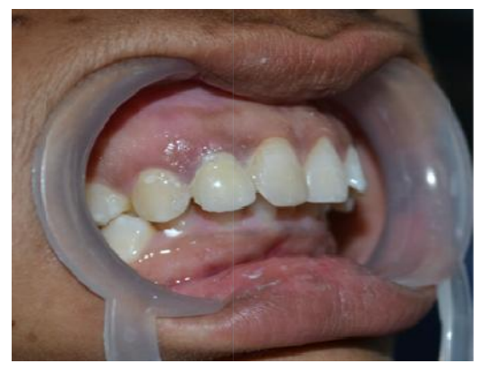
Fig.10(a),(b). Richmond crown after cementaion