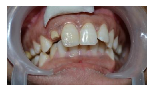
Fig. 4b.Composite buildup with 11

Post and core fabrication: Vaseline application was done inside the canal and over the prepared crown.