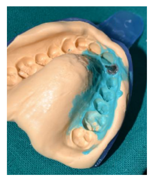
Fig.8(b) Final impression

Diagnostic cast was made and RICHMOND CROWN was prepared. Fig.9