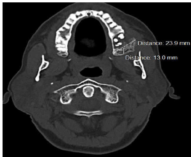
Fig. 2. CT scan shows mixed lesion involving the left posterior maxilla showing a ground glass pattern