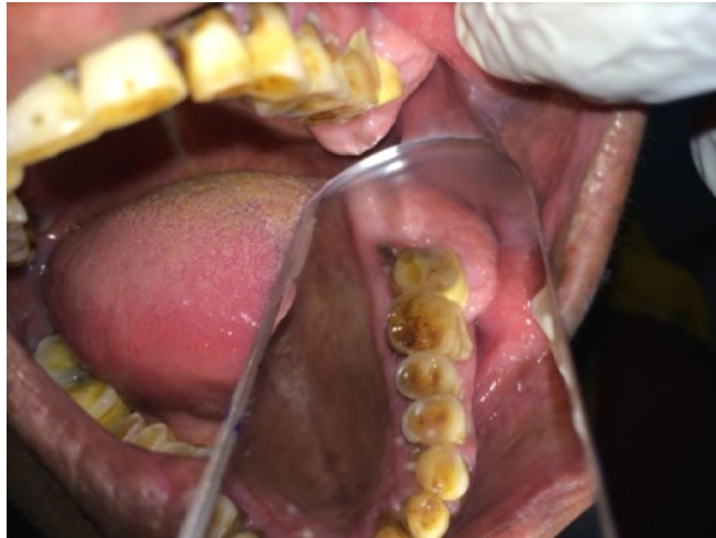
Fig. 1. Intraoral examination reveals a well defined solitary tumor mass involving the posterior left maxilla irt 27, 28

OF of maxilla is a rare neoplasm with only 30% of involvement of cases. (Speight and Carlos, 2006) It is a well