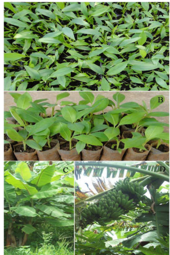
Figure 2: High frequency regeneration from the leaf callus Musa paradisiaca cv. 'Puttabale'.