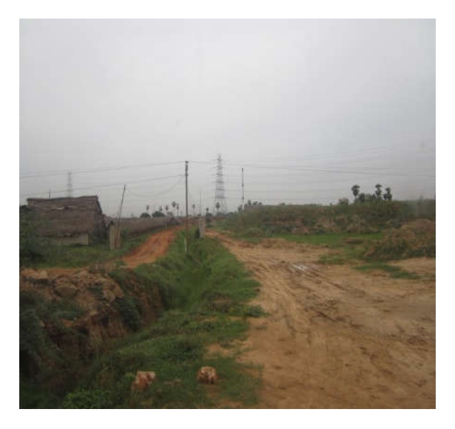
Figure 1. Snapshots of the Village

Phase 3 - Small Scale Vermicompost Unit Initiated in the School