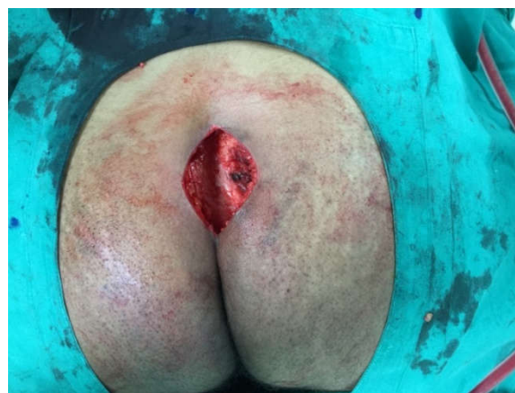
Fig. 3. Defect after rhomboid excision