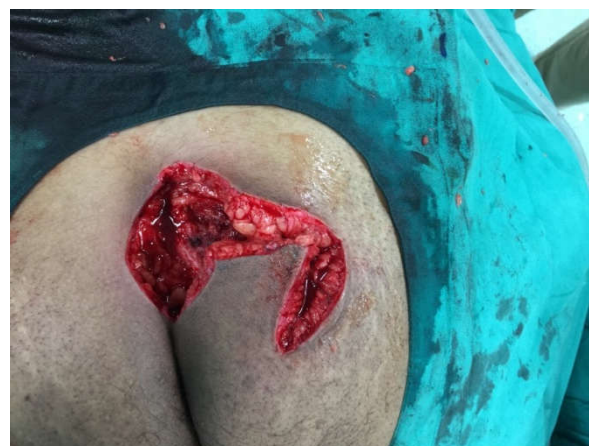
Fig. 4. Making Limberg flap