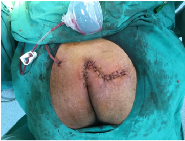
Fig. 5. Immediate Post operative photograph