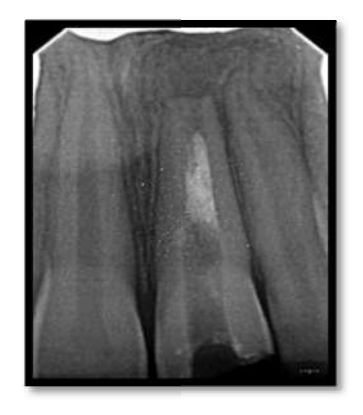
Fig. 5. MTA placement over PRF

The fiber optic post (Coltene) was inserted into the canal and cemented with resin cement (Ivoclair Vivadent). The crown portion was restored with light cure composite (Ivoclair Vivadent) (Figure 6&7).