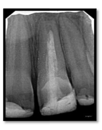
Fig. 6. Post operative RVG after fiberpost cementation