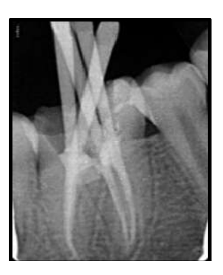
Fig. 5. Trial fiitting of GP