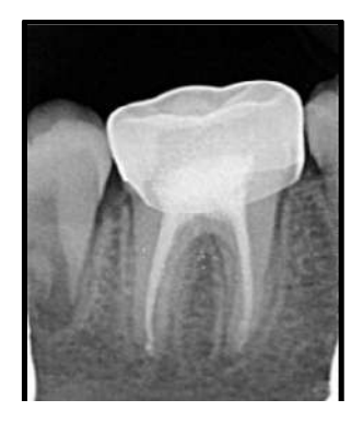
Fig. 6. Post operative radiograph after obturation followed by SS crown