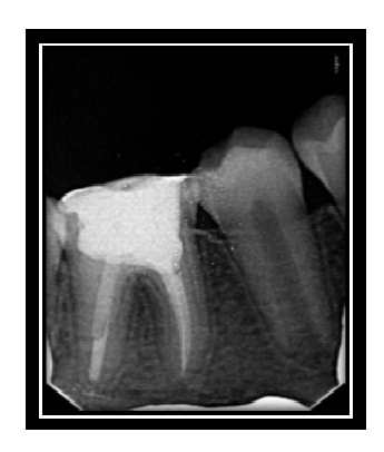
Fig.4. Fiber-post cemented in distal canal