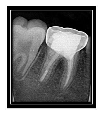
Fig. 5. SS crown with immediate Post-operative Radiograph

Access cavity was sealed with CAVIT. After 24 hrs, the fiber optic post (Coltene) is inserted into the distal canal and cemented with resin cement (Ivoclair Vivadent) (Figure 4). The crown portion is restored with light cure composite (Ivoclair Vivadent) followed by stainless steel crown (Figure 5).