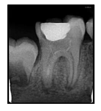
Fig. 3. Intracanal Ca (OH)2 medicament Placed

Clinically, apical barrier formation was confirmed by using gutta-percha (GP) point to check for the presence of resistance "stop" & absence of hemorrhage or exudates (Figure 4). Then affected tooth was obturated with GP using lateral condensation technique & extra coronal restoration done with stainless steel crown (Figure 6).