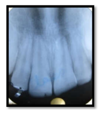
Fig. 2. Preoperative radiograph