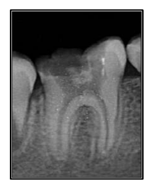
Fig. 1. Preoperative radiograph