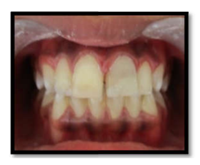
Fig. 7. Post operative clinical

All cases six months follow up were showed successful outcome both clinically and radiographically and patients were instructed for further follow up every 6 months interval.