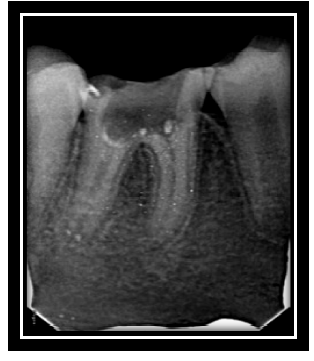
Fig. 1. Preoperative radiograph

history of the patient was non-contributory. Clinical examination revealed grossly carious 46 with gingival swelling which was tender on percussion & gave delayed response to pulp vitatity test. Radiographic examination revealed presence of peri-apical radiolucency with open apex in distal root (Figure 1).