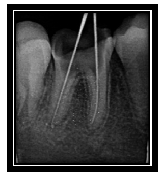
Fig. 2. Working length determined

Treatment plan was decided, MTA Apexification in distal root followed by fiberpost & obturation in mesial roots with GP. After rubber dam isolation conventional access cavity was prepared & working length determined in 46 (Figure 2). Root canal debridement was done by using K file followed by copious irrigation with normal saline & 2.5% Sodium hypochlorite. Calcium hydroxide was placed into the canal for 1 week & access cavity temporarily restored with CAVIT<sup>TM</sup>. Next appointment, Calcium hydroxide was removed with copious irrigation with 2.5 % Sodium hypochlorite alternatively with normal saline. Canals were dried with paper points. MTA (Angelus) was mixed in a sterile glass slab with spatula as recommended by the manufacturer. MTA was transferred into the root canal with amalgam carrier and the apical portion of the distal canal was filled with MTA by hand obturation technique to create an apical plug of 4 mm in thickness using MTA pluggers. Correct placement of MTA was confirmed by Radiovisiography (RVG). Then the mesial canals were obturated completely with GP by lateral condensation method (Figure 3).