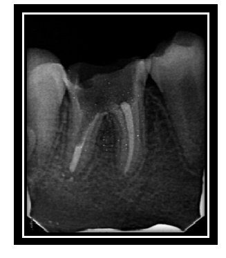
Fig. 3. MTA apical plug in distal canal