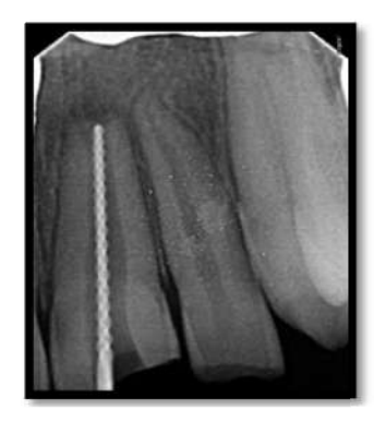
Fig. 3. Working length determined