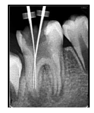
Fig. 2. Working length determination

Clinically, apical barrier formation was confirmed by using gutta-percha (GP) point to check for the presence of resistance "stop" & absence of hemorrhage or exudates (Figure 4). Then affected tooth was obturated with GP using lateral condensation technique & extra coronal restoration done with stainless steel crown (Figure 6).