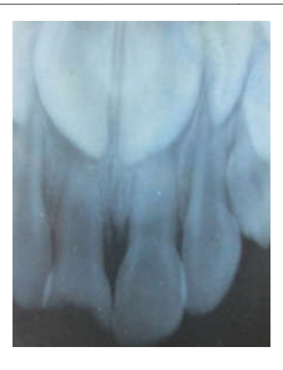
Figure 1. Pre-operative IOPAR