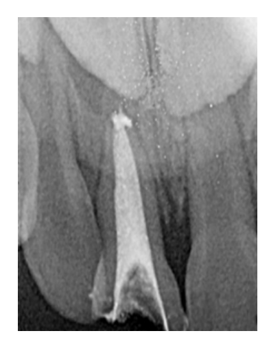
Figure 3. Per-operative IOPAR of Obturation with radiopaque material