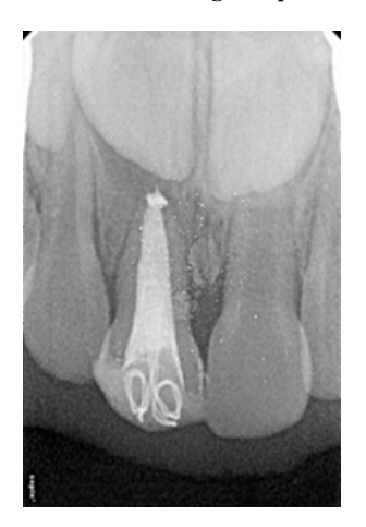
Figure 6. Post-operative IOPAR