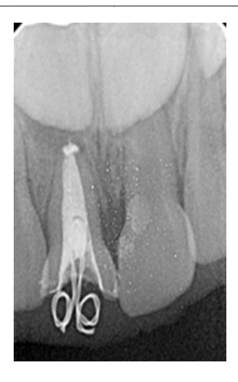
Figure 5. IOPAR of omega loop in the canal

A strip crown was used and the crown was reconstructed. Two-third of the strip crown was filled with selected shade of packable composite (Tetric N Ceram, IvoclarVivadent) The occlusion was checked and after the removal of any interference, final finishing and polishing of the restoration was done as shown in Figure 8.