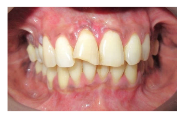
Figure 4. 6 months follow up with no recurrence