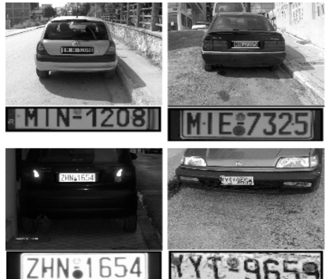
Fig.1. Sample Image