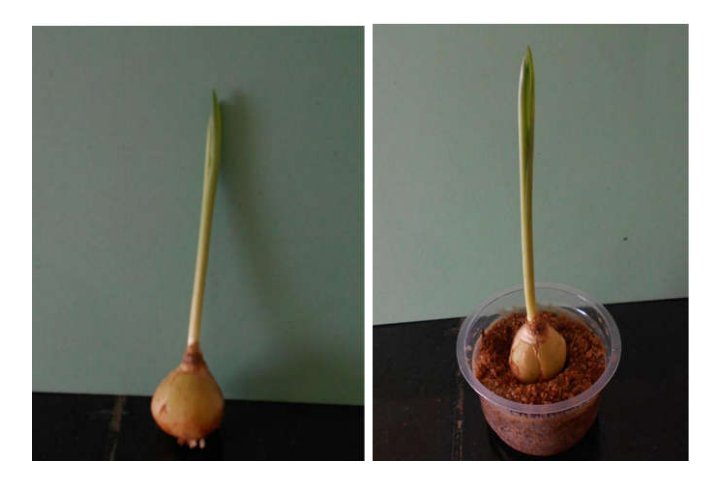
Fig. 1. Vegetative bulbs of Urginea

The Inter-simple sequence repeat (ISSR) is semi arbitrary markers amplified by polymerase chain reaction (PCR) in the presence of one primer complementary to a target microsatellite. Each band corresponds to a DNA sequence delimited by two inverted microsatellites (Zietkiewicz et al., 1994; Tsumara et al., 1995; Nagaoka & Ogihara, 1997). It does not require genome sequence information; it leads to multilocus, highly polymorphous patterns and produces dominant markers (Mishra et al., 2003). ISSR PCR is a fast, inexpensive genotyping technique based on variation in the regions between microsatellites. This method has a wide range of uses, including the characterization of genetic relatedness among populations, genetic fingerprinting, gene tagging, detection of clonal variation, cultivar identification, phylogenetic analysis, detection of genomic instability and assessment of hybridization.