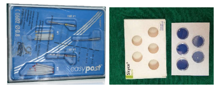
Figure 6. Fibre post kit and Tooth jewellery set

Post space was prepared using peeso reamers {supplied by manufactures of fibre-post (easypost, dentsply)} leaving behind 5mm of guttapercha and fibre post fit was verified radio graphically. Para core dual cure resin was used for the cementation of post following manufacturer's instructions. Post in the canal was first cemented and cured (Figure 6). Tooth jewellery (Coltene) was used to camouflage fracture line and also to enhance the esthetics. It was placed with the help of flowable composite on the distoincisal corner of the tooth and cured. (Figure 7)