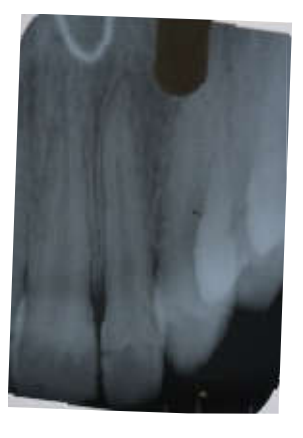
Figure 2. Preoperative IOPA