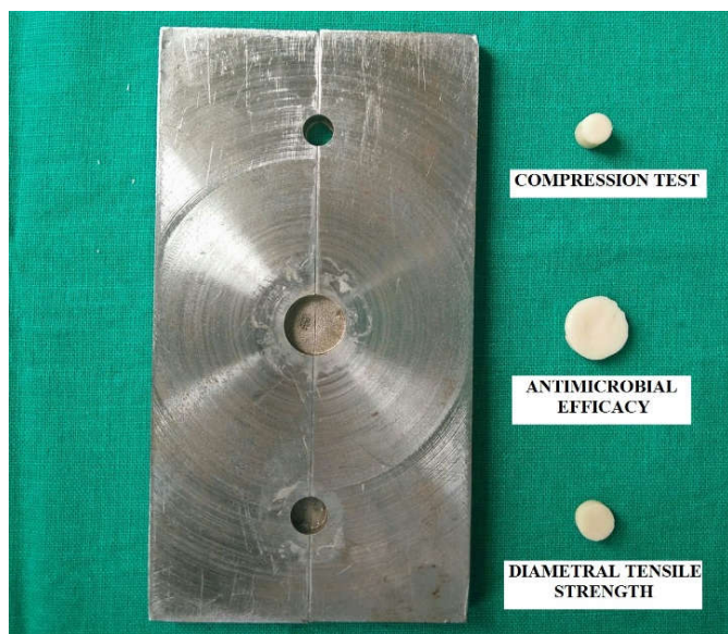
Figure 1. Steel moulds and representative discs for each test

The powder for each of the groups was dispensed on the mixing pad in the recommended ratio of 3.6:1. It was then manipulated using an agate spatula by the folding method. A sterile cement carrier was then used to carry the cement to the desired mould that was pre-coated with petroleum jelly to facilitate removal. This cement was then allowed to set and was retrieved in 10 minutes from the mould. (Figure 1) The excess material if any was removed using a wet sandpaper. Any samples with gross deformities and voids were discarded. These specimens were then stored in airtight containers for 24 hrs and were then tested for compressive and diametral tensile strength testing. However, the storage time was 1 hr in case of antimicrobial efficacy tests.