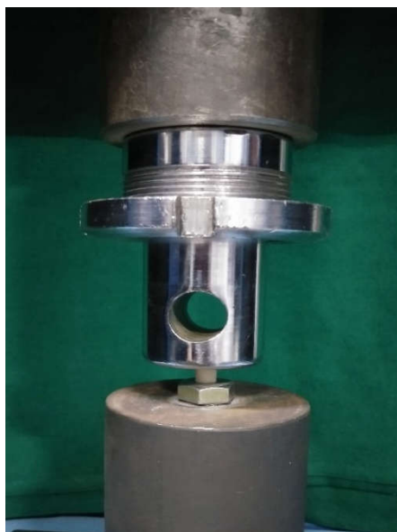
Figure 3. Compression strength testing

thickness and 6 mm diameter. These samples were then stored in airtight containers for 24 hrs prior to testing. Prior to testing, the diameter of each specimen was determined using a metal scale and specimens were placed with their flat ends perpendicular to the plates of universal testing machine. (Figure 4) A compressive load was applied at a crosshead speed of 1mm/min. The maximum force applied when the specimen fractured was recorded, and the Diametral tensile strength was calculated by the following equation: