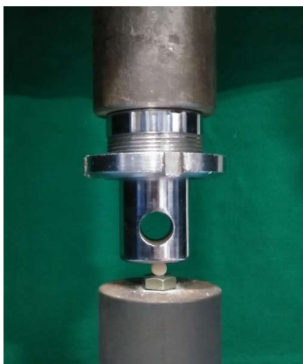
Figure 4. Diametral tensile strength testing