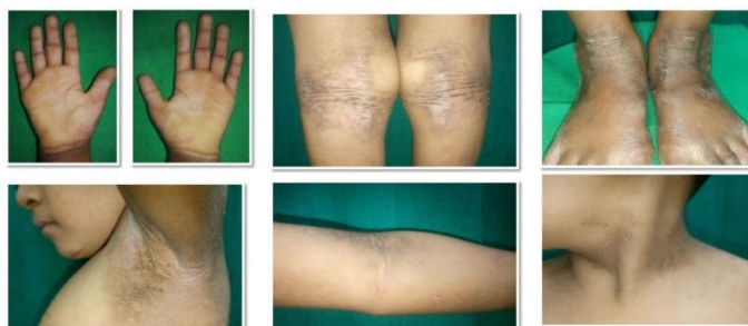
Figure 4. Diffuse palmoplantar keratoderma Lichenification over flexure ie bilateral cubital fossa, neck creases, popliteal fossa, ankle