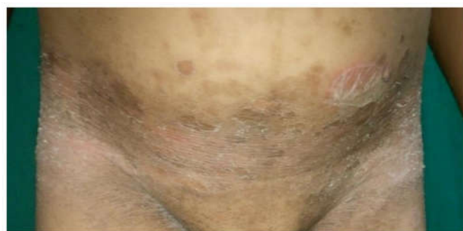
Figure 3. Mauserungs phenomenon