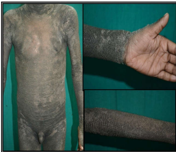
Figure 1. Thick verrucous plaques with cobblestone pattern present all over body with extensors showing few areas of peeling of skin to leave dry skin

hyperkeratosis, it was classified as EHK NPS-1. A clinical diagnosis of Bullous congenital ichthyosiform erythroderma of Brocq (BCIE) was made (Table 2) (John, 1994).