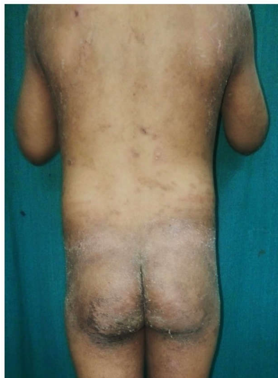
Figure 2. Peeling of skin and fluid filled lesions

pattern over body. There was no history of blistering at birth. On examination there was thick brownish warty excrescences in a blaszkoid pattern over body extending onto palms and soles with sparing of face (Figure 7). Based on classification of EHK, could not be classified into any of the six types (Table2) (3). We clinically diagnosed it as systematised epidermal nevus, sporadic variant.