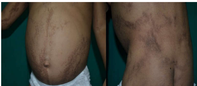
Figure 7. Thick brownish verrucous plaques in a blaszkoid pattern over body