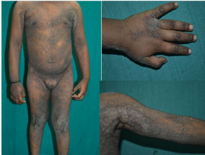
Figure 5. Multiple linear hyperkeratotic and hyperpigmented horny excrescences with thick dry scaling arranged symmetrically in a blaszkoid pattern over body

bilateral upper limb, lower limb and trunk since 2 months of age. No history of blistering prior to appearance of lesion. On examination there was verrucous ridged plaques on trunk with flexural lichenification (Figure 8). There was complete sparing of palms, soles, face and genitalia (Figure 9). Based on classification of EHK, hystrix like scaling with absence of blistering and palms soles involvement could not be classified into any of those 6 types (Table2) (John, 1994). We clinically diagnosed it as Ichthyosis hystrix Lambert type.