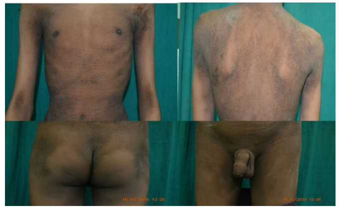
Figure 8. Verrucous ridged plaques on trunk with flexural lichenification