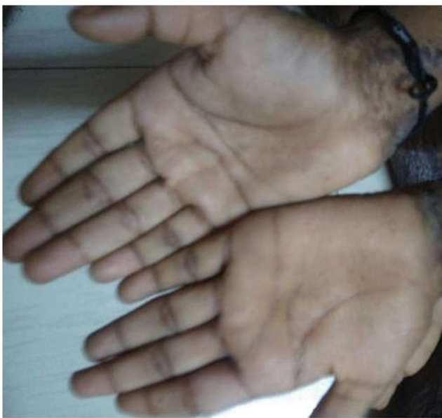
Figure 6. Yellowish keratotic thickened skin over bilateral palms suggestive of keratoderma