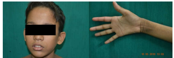
Figure 9. Complete sparing of face and palms