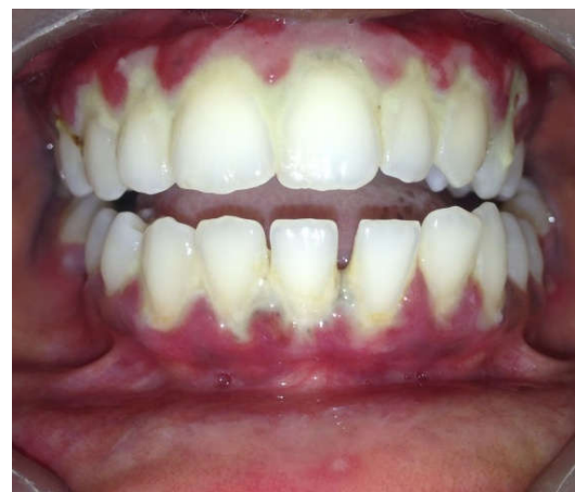
Figure 4A. Preoperative view showing pseudomembrane formation in case 2