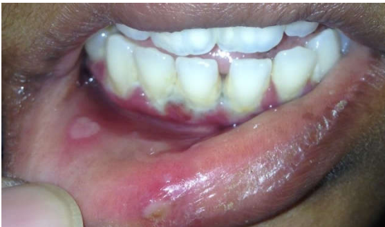
Figure 5. Ulcer present on the vermillion border of the lower lip in case 2