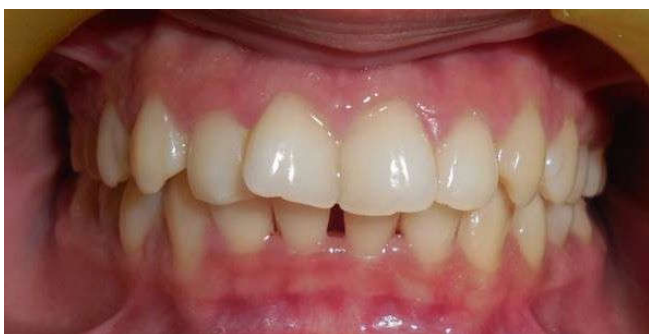
Figure 1B. Postoperative view of case 1 showing complete healing