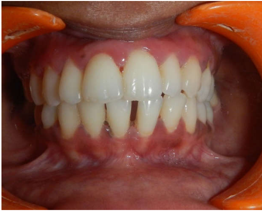
Figure 4B. Postoperative view showing complete healing in case 2