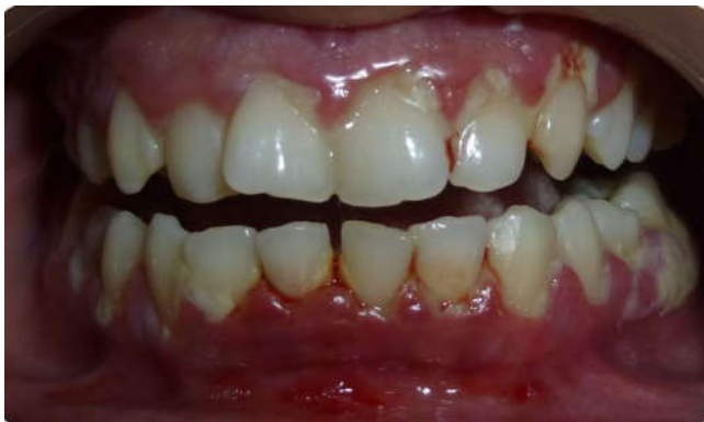
Figure 1A. Preoperative view of case 1 showing pseudomembrane