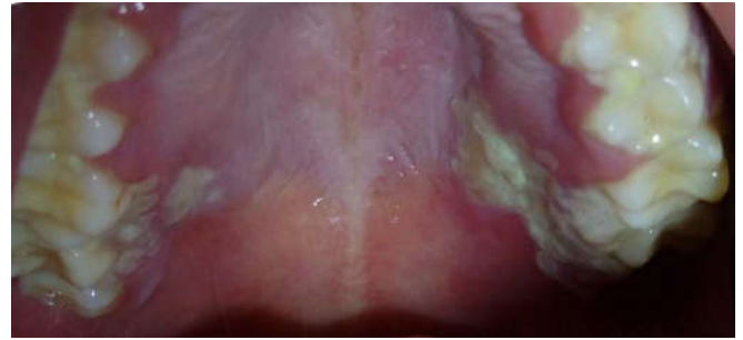
Figure 2A. Preoperative view of palate showing pseudomembrane in case 1