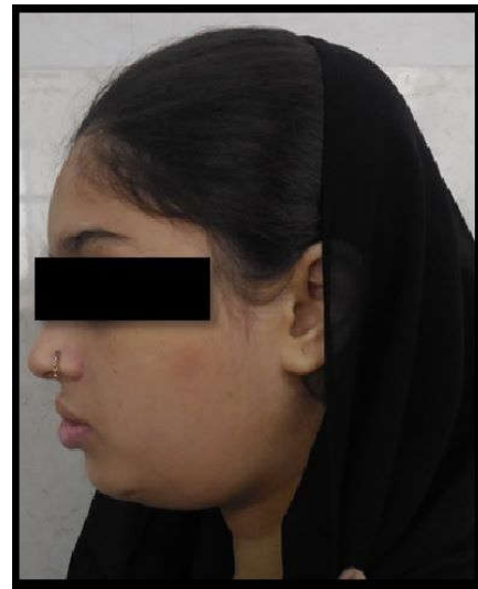
Figure 3. Submandibular swelling seen preoperatively in case 1