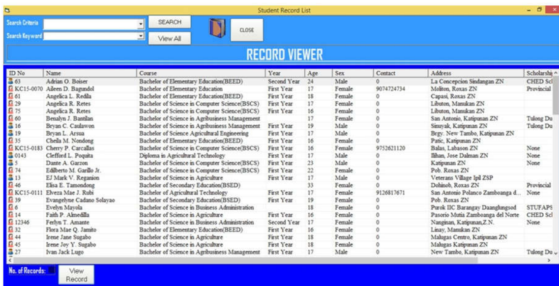
Figure 4. Student Record Viewer of the Automated Student Record System