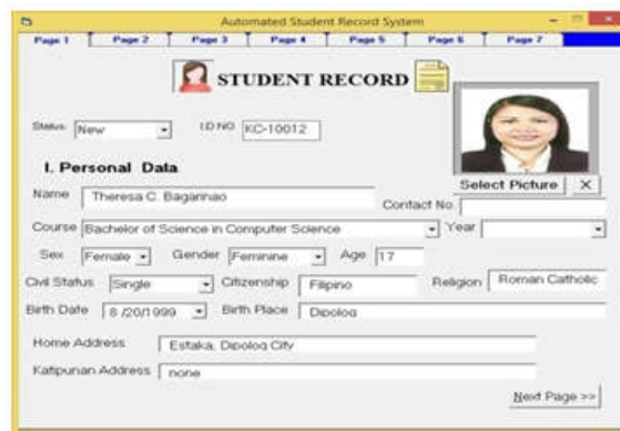
Figure 3. Page 1 of Student Record Window in the Automated Student Record System