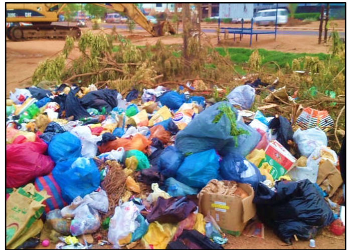
Figure 2.1. An illegal dump in Khartoum state

Khartoum State data were collected from Khartoum state cleaning corporation (KSCC) and Khartoum localities centers. The results of census in Khartoum state and the total amount of wastes collected from seven localities in Khartoum state for the years 2008, 20012 and 2016 are showed in the tables below.