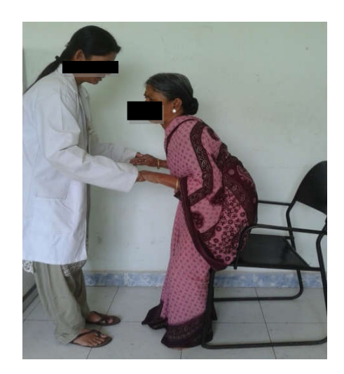
Figure 2. Sit to stand with support

Self-stretch of arm strengthening activity of upper limb