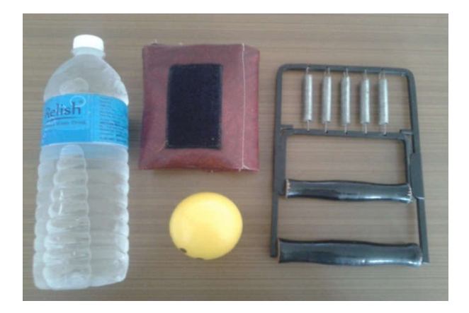
Figure 1. Outcome measures

Parkinson disease questionnaire – 39 (PDQ - 39)