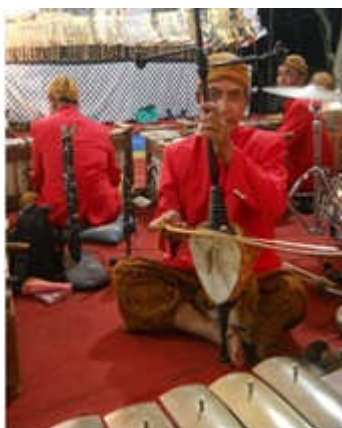
Figure 1. Fiddle Player