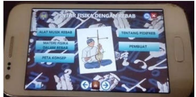
Figure 2. Main Menu Page