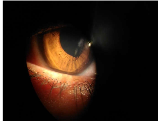
Figure 3. Follow up