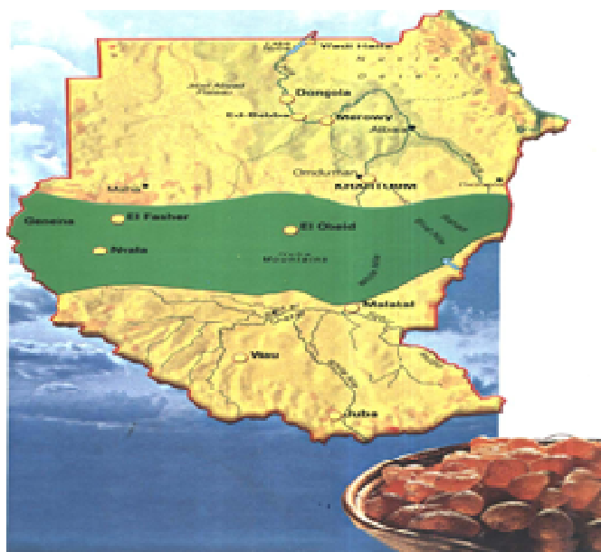
Fig. 3. The map of the gum belt areas in Sudan

activities, and then redistribute these goods to the end consumers through a network of sub-agents located in the European, American and East Asian countries.