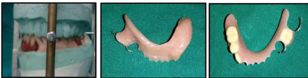
Fig 5 (a,b,c). (a)Artificial teeth arranged 36, 43,44,46 (b,c) final removable prosthesis