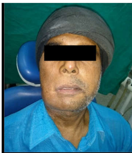
Fig. 7. Extra oral view after treatment

mandibular prosthesis did not traumatize the maxillary teeth and gingiva and served to resist the forces of arch contracture and maintain the maxillary teeth on the defect side in proper alignment until an acceptable position was achieved. The wax pattern was checked before processing and cured in heat cure acrylic resin. After curing, the appliance was finished & polished (Fig-2c) and checked intraorally (Fig-3a). The patient was advised to use the guide flange prosthesis throughout the day, except at night and during meals and instructed about the exercises i.e. maximum opening of the jaw followed by grasping the chin and moving the mandible away from the surgical side and straight opening and closing exercise to reduce trismus and avoid deviation. The patient was recalled after every 3 weeks to reevaluate the occlusal relationship. After 3 months, acceptable occlusion was achieved (Fig-3b). Patient's mastication was improved and he was able to move into maximum intercuspation by his own. For final removable prosthesis, primary impressions were made with irreversible hydrocolloid (Fig-4a) and poured with type III dental stone. A custom tray was fabricated with autopolymerising acrylic resin. To record lingual extension on non-defect side and the depth of the defect, border moulding was done with low fusing impression compound and final impression of lower arch was made with medium body polyvinyl siloxane impression