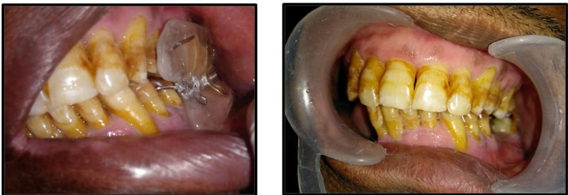
Fig 3(a,b). (a) Guide flange prosthesis in patient's mouth (b) Occlusion achieved after 4 months