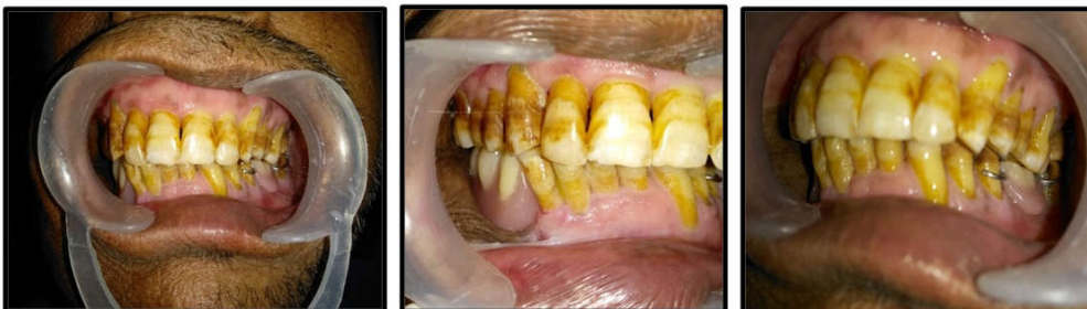
Fig. 6. (a,b,c) : Intraoral view of the patient with denture