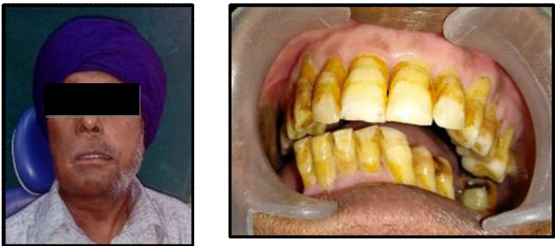
Fig-1(a,b). Preoperative(a) Extraoral view (b) Intraoral view