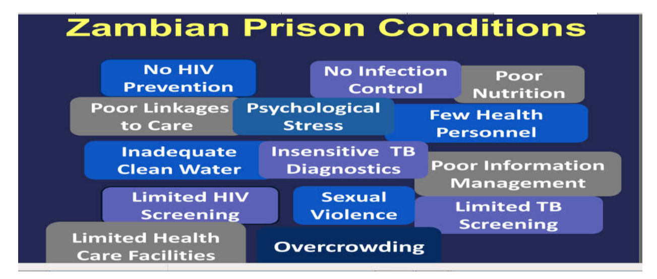
Figure 2. Situational Analysis for prison conditions-2012