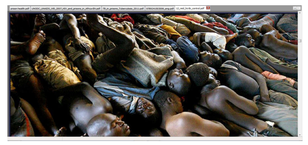
Figure 3. Ref: UN Universal Declaration of Human rights; ref: UN General Assembly: Basic Principles for the Treatment of Prisoners, 1990