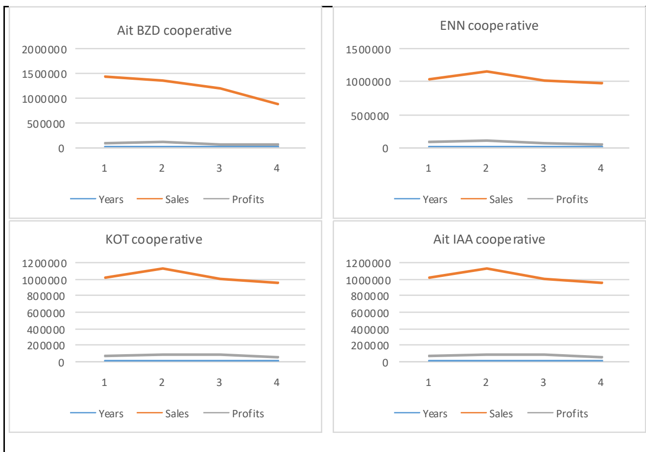
Fig.1. The volume of milk sales and the profits made by the different cooperatives during the period of 2016-2019.