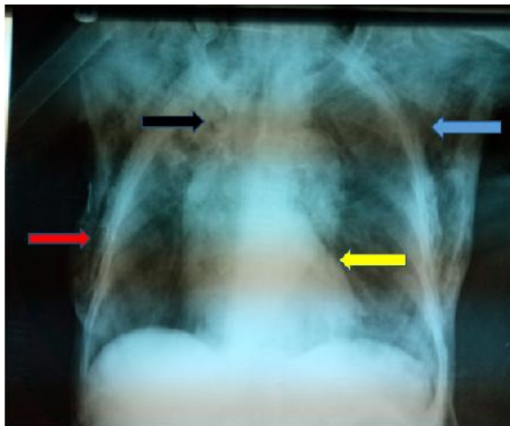
Figure 1 Plain supine chest radiograph showing lucencies in the soft tissues of lateral chest wall (right red arrow), scapular region (left blue arrow) and tracking along the margins of the heart (left yellow arrow). Right lung contusion also noted (right black arrow)

A forty-five year old house-wife was referred for an emergency plain chest radiograph on account of sudden onset restlessness, chest pain and discomfort, rapid and difficult respiratory effort following a road traffic accident. A middle aged women in respiratory distress, not pale, conscious and alert but in painful distress, had swollen neck, lateral chest wall, anterior chest wall, and fullness of the right supraclavicular region with severe chest tenderness. The patient had a supine chest radiograph that showed multiple and bilateral rib fractures (Figure 2), fractured right clavicle (Figure 2), lucencies tracking along the heart and great vessels (Figure 1), lucencies in the lateral chest wall and in the scapular region (figure1) and neck regions bilaterally (Figure 2). There is associated lung contusion bilaterally more marked on the right upper zone (Figure 1).