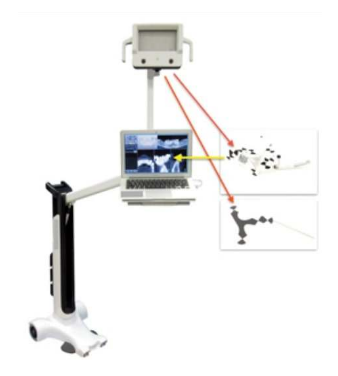
Fig. 1. An optical tracking sensor tracks the JawTracker, Tracer-Tracker, Drill-Tracker and instrument.

converted into a DICOM image. The system then superimposes the position of the dental tool being used over the virtual CBCT of the patient. Then the clinician by looking at screen interface obtains feedback of the position of the tool in relation the patient's jaw of the virtual scan and can adjust the angulation or depth in order to obtain the wanted procedure outcome. It involves the Trace and Place (TaP) system. TaP may avoid the need for a fiducial stent, with the resultant increase in the accuracy and ease of treatment. A Jaw -Tracker is attached to the patient's jaw and dental instrument, and are traced using an optical tracking system. The tip is superimposed on a patient's CBCT scan that has been traced. TaP technology improves the ease of accuracy and treatment and provides for minimal invasive access cavity preparation and reduces the size of osteotomies. Dynamic Navigation system is also in compliance with ultrasonic tips used for root end retro-preparation. (Fig. 1)