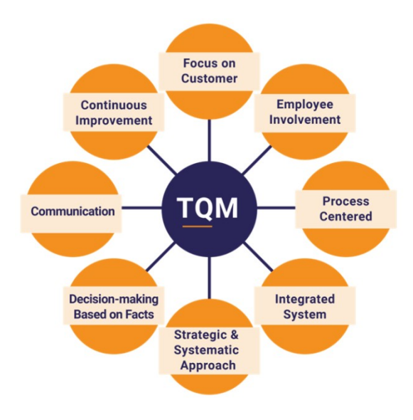
Figure 3. TQM and its Components

The collected data recommended some major impacts of challenges in TQM in higher education in West Bengal as well as all over India.