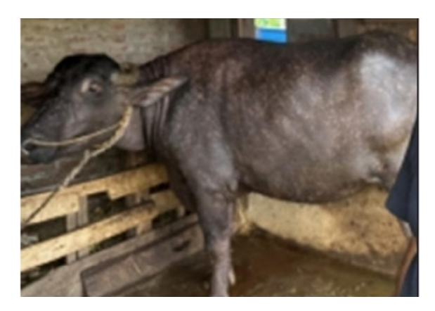
Fig.4 & 5. After 18 days

According to M. Ranjithkumar et al. , (2018), the animal was successfully treated oxytetracycline, normal saline, and chlorpheniramine maleate. Under field conditions a single injection of long acting Oxytetracycline was found effective in treating dermatophilosis (llemobade et al. , 1979). Other cases were alsoreported. But none of them involved the use of homeopathic medicine, so this is likely the first instance where homeopathy was successfully used at a low cost. This study details the occurrence of dermatophilosis in a buffalo and details its full clinical recovery after homeopathic treatment from Nepal.