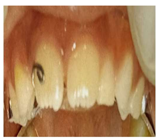
Figure 2. Intraoral image of the appliance

Finger spring was activated 2 mm once in month for 2 months until space regained. Conventional band and loop space maintainer cemented irt 75 (figure 4).