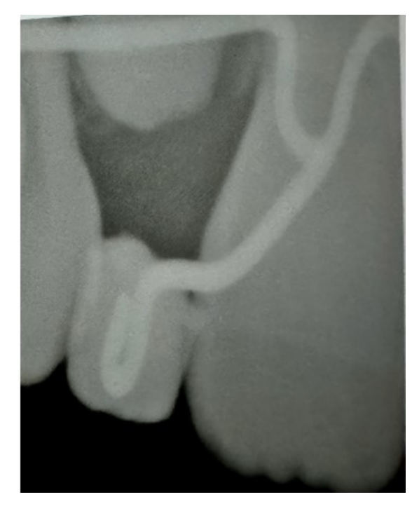
Figure 7. Radiograph showing luxatemptooth incorporated with finger spring