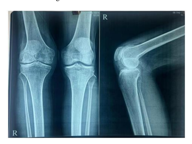
Figure 1. X-Ray of Right knee shows decreased joint space in lateral compartment

over the anteromedial aspect of the knee joint longitudinally centering patella. Subcutaneous dissection was carried out and mass was meticulously approached from all directions. Proper excision was carried out of soft tissue mass and meticulous haemostasis was achieved. His patella was everted and knee joint was flexed. This manoeuvre revealed a cartilage defect of about 2 cm x 1 cm in medial femoral condyle inferiorly. There were also rough areas due to degenerative changes seen in femoral condyles, tibial condyles, and patella articular surface. This was the cause of restriction of movement and pain while sitting cross legs and in the squatting position of patient. Thorough excision of soft tissue mass was done from knee joint and a wash was given. Meticulous repair of quadriceps tendon was done and closure of wound was done after putting drain. The compressive dressing was applied and brace was given post operatively. Soft tissues were sent for biopsy. Histopathological examination revealed Cavernous type of Synovial Hemangioma of the knee joint. Postoperatively patient was advised physiotherapy with stitch removal after 2 weeks. He was also advised regarding probable surgery in future for cartilage loss.