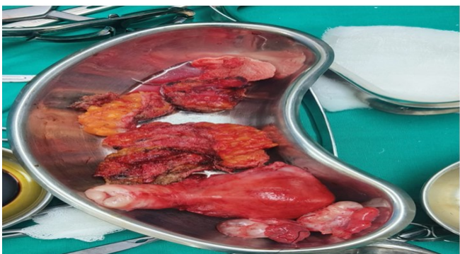
Picture-4- Clinical picture of the resected specimen

Patient has been on regular follow up for the last one year with no recurrence of complaints.