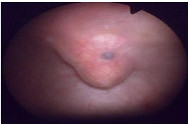
Picture 2. Cystoscopy image showing the endometrial mass extension to the dome of the urinary bladder