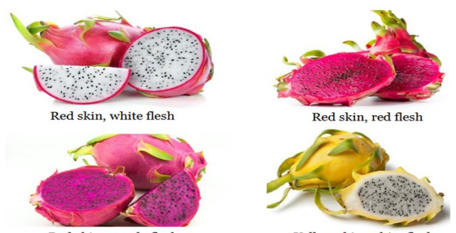
Red skin, purple flesh

While dragon fruit's thick, leathery skin can be intimidating, eating this fruit is quite simple. The trick is finding one that is perfectly ripe. An unripe dragon fruit will be green. Look for one that is bright red. Some spots are normal, but too many bruise-like splotches can indicate that it's overripe. Like avocado and kiwi, a ripe dragon fruit should be soft but not mushy.