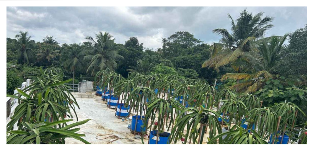
Remabhai grows 100 plants of dragon fruits in 50 large plastic barrels

Revealing her technique for making the nutrient-rich combination, she says, "Take a plastic barrel and make a small hole at the bottom for drainage. Put a thick layer of green leaves, then a layer of sawdust, followed by a layer of rice peel, and a thick layer of compost (say 3 kg). Add 100 grams of bone meal as the last layer. Plant your saplings thereafter. I planted two saplings in each container." "This combination provides all the required nutrients and enough aeration for root growth. It has been a convenient way for me to grow plants without soil," she adds. Remabhai has also crafted her own organic fertilisers using a blend of dry leaves, vegetable waste, and natural ingredients like fish, prawn skin, and crab shells for accelerated growth and fruiting. Her innovative approach yielded vibrant and healthy dragon fruit plants.Sharing the secrets of her organic fertiliser, she says, "Take 1 kg of fish, prawns, crab shells, and an equal quantity of jaggery. Mix them with tender papaya peel. Keep it under shade and the fertiliser will be ready for use in about three months. It's a very good source of calcium and phosphorus. These minerals are very useful for the growth of dragon fruit plant."