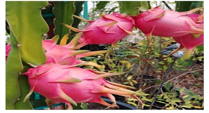
The incredible looking dragon fruit!

Flowering and Fruiting: The off-white dragon fruit flower blooms at night. Pollinators are drawn to them by their scent. Early in the morning is the best time to pollinate the dragon fruit with honey bees ( Apis cerema ), little honey bees ( Apis florae ), and rock bees ( Apis dorsata ). Around semi-arid regions, dragon fruit flowering begins in June.