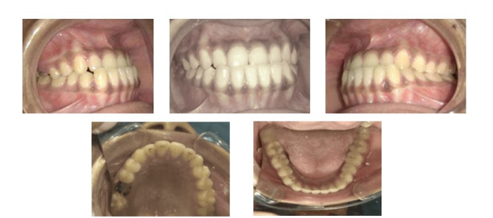
Figure 2. Pre-treatment Intra-oral Photographs