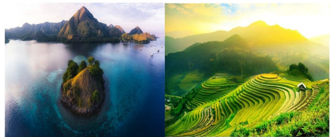
Figure 4. Places to visit close to nature and land terrain (Vietnam) 21, 22

lifestyle. 19 UAE and Qatar rank highest for safety and security, offering a luxurious, modern, and tax-efficient lifestyle. Professor Richard D. Wolff, a renowned economist and expert on global economic systems, emphasizes a key difference in the financial structures of China and the United States. In the U.S., most businesses are privately owned and operated, reflecting a predominantly capitalist system. In contrast, China employs a mixed economic model. Wolff explains that approximately 50% of Chinese enterprises are private, with the remainder being publicly owned and managed by the government. This dual structure is overseen by a strong central government that coordinates and supervises both sectors. Wolff notes that this governance approach has been more effective in mobilizing national resources. He suggests China's centralized oversight of both public and private sectors has significantly contributed to its rapid economic growth and expanding global influence. 20