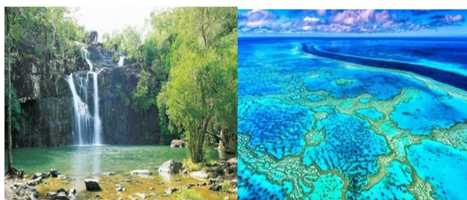
Figure 1. Wildlife and Rainforests 12