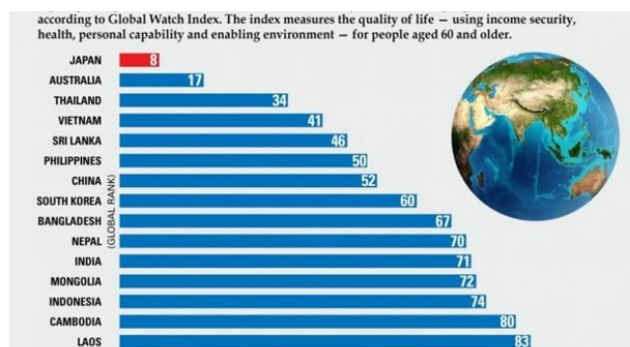
Figure 8. List of the best Asian countries to live (for aged people) in respect of quality of life 36

one of the lowest crime rates globally. This isn't just reassuring; it's a green light for families seeking a secure home. Additionally, the police are proactive and present, maintaining order. But safety isn't everything. The UAE is renowned for its world-class infrastructure—sleek roads, dependable public transit, and airports that resemble luxury hotels. Healthcare? Outstanding, with hospitals equipped with cutting-edge technology and specialists worldwide. Education also shines: from diverse international schools to esteemed universities, making it ideal for families or those pursuing higher education. And let's not forget the lifestyle—vibrant dining, entertainment options, and iconic shopping venues. Whether you're into concerts, sports, or relaxing spas, there's something for everyone.