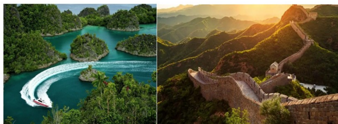
Figure 6. Culture and nature (Bali's and Great Wall) 29

Indonesia, one of the seven most populous countries, which together account for over half of the world's population and roughly half of global GDP, ranks 48th on the Global Peace Index. China is 88th, India is 116th, Brazil is 131st, the United States is 132nd, and Pakistan is 140th, and Nigeria is 147th. 28 Ten indicators generally evaluate societal safety and security. They suggest that low crime rates, few terrorist acts and violent protests, friendly relations with neighboring countries, political stability, and a small percentage of internally displaced persons or refugees indicate a peaceful society. The eight pillars of positive peace include effective governance, a healthy business environment, respect for others' rights, good neighborly relations, open information flow, high human capital, low corruption, and fair resource distribution resources.