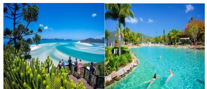
Figure 5. Great barrier reef and beach/lagoon 24

Deciding where to move abroad can feel like choosing a new planet—overwhelmed by too many options, opinions, and no clear “best” choice. Everyone has different priorities: some seek safety, others adventure, and a few just want affordable beach cocktails. The key is to narrow down the list to manageable options and compare countries based on what truly matters to you. In Southeast Asia, costs are generally lower than in North America—except for Singapore, which seems priced in a different universe. However, cheap doesn't always mean happy. The cost of living is just part of the picture; the quality of life determines whether your budget leads to comfort or mere survival. Cambodia is extremely cheap, but it comes with infrastructure and service issues typical of a “third-world” country. Phnom Penh has some luxury expat communities, but overall, life in the Kingdom of Wonder is quite “meh.” The Philippines is slightly cheaper than Thailand, but housing and healthy food options are less developed. Larger cities feature fancy expat areas, yet their overall standard of living can't match more developed neighbors. Thailand surpasses many ASEAN countries with its diverse housing options and lifestyles suitable for any budget. Infrastructure and services meet first-world standards and are constantly being enhanced. Whether in a skyscraper penthouse in vibrant Bangkok or a charming beach bungalow on one of its 1,430 islands, expats in Thailand are well taken care of choice. 23