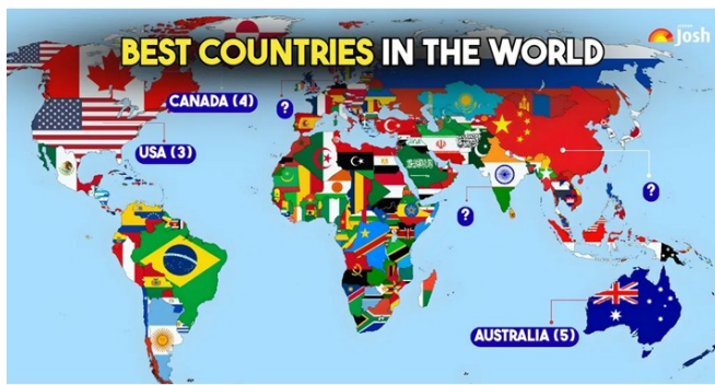
Figure 2. List of top 10 best countries in the world 17