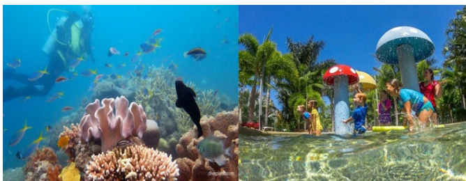
Figure 3. Activities and enjoyment in free time 18

In Asia, Japan is regarded as one of the safest countries with a high standard of living, excellent public transportation, and a rich cultural heritage. Meanwhile, Singapore stands out as a top country in Asia for overall quality of life, safety, and education, providing a modern, multicultural environment. Malaysia is another popular choice, known for its affordability, quality infrastructure, and English proficiency, making it suitable for long-term residence and retirement. Additionally, Thailand is a leading destination for retirees and expats, offering a low cost of living, delicious food, and a relaxed