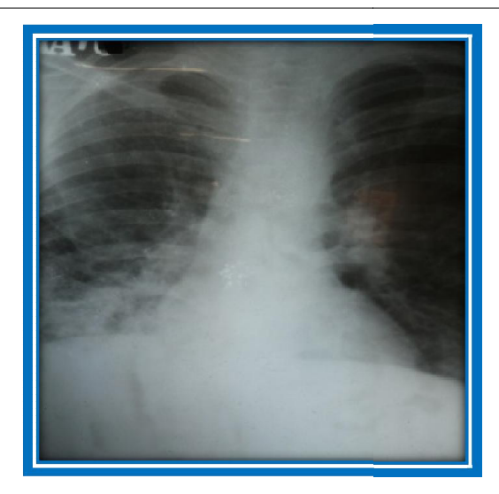
Fig.1. Chest X-ray