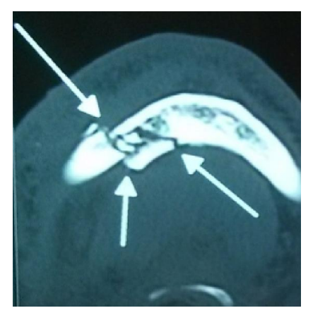
Figure 3.Fracture of body of mandible

Late complications of mandibular fractures include pseudoankylosis, osteomyelitis of mandible, ischemic necrosis of the condylar head and posttraumatic injury of the articular disc. Magnetic resonance imaging (MRI) is the modality of choice for diagnosing these complications and it is also the best imaging modality for the evaluation of the temporomandibular joint, before and after surgical treatment (Romeo et al. , 2009)(Fig 3 and 4).