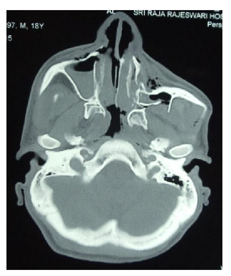
Figure 1: Axial section of CT

independently from rest of the midface and skull base. The apex of the pyramid is situated just below the nasofrontal suture. The fracture of obliquely oriented spans through the floor and medial wall of orbit and zygomaticomaxillary suture, excluding the zygomatic bone. Axial and coronal reformatted images are useful for visualizing the extension of a type II Le Fort fracture in an oblique plane through the medial and inferior orbital walls (Kellman,2010)(Fig. 1 and 2).