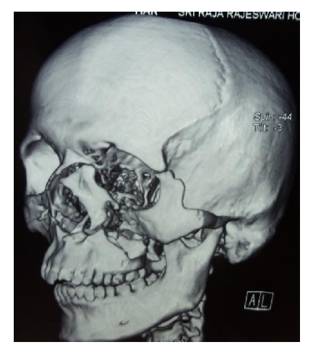
Figure 2 (b): Lateral view of 3D reconstruction