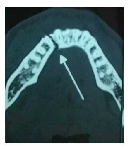
Figure 4. Parasymphyseal fracture