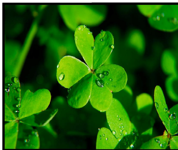
Oxalis corniculata leaves

Order : Oxalidales Family : Oxalidaceae Genus : Oxalis Species : O. Corniculata